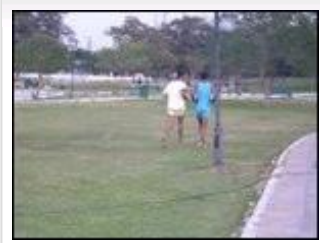
barefoot runners in park

Today, our train is at midnight to Jaisalmer – an overnight train