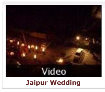
Video Jaipur Wedding