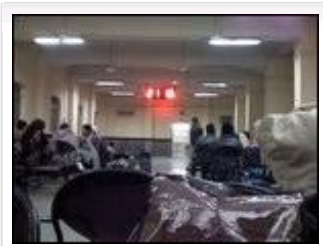
Train station waiting room

----- Commentary: A tiny paragraph on page 4 of today's Times of India says that 58 have died in Uttar Pradesh this winter due to the unusually cold season. On page 11 we learn that every three seconds one child dies in India. But here's the front-page news item: an actor in New York died of an overdose.