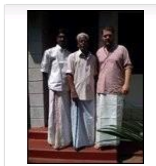
men men men men

wanted to try it on. I agreed, and all the