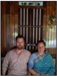
Surely you can't be serious.

don't smile very much in pictures. In fact, they'll be laughing and smiling, then a camera comes out and everyone stops smiling. Maybe it's a cultural thing not to show teeth or something.