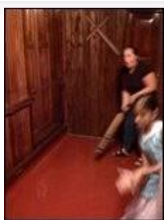
oop. are you okay?