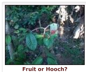
Fruit or Hooch?

on the first day that they enclose near-ripe fruits in plastic to keep the insects and birds away in a non-pesticide