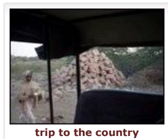
trip to the country

We woke the next day and went to the hotel breakfast (another large buffet) with all the other tourists. We're different, though, b/c we're much more polite and we speak fluent Hindi.