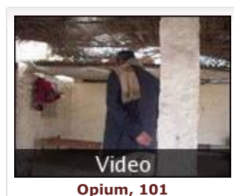
Video Opium, 101

He said that it couldn't be denied that opium is used by a lot of people in the area, as part of certain holidays, sometimes for guides and grannies. After an explanation of the hookah, the herbs, and the plant, the men sang a song to Ganesh. Our guide showed us a palm-sized clump of opium and we sniffed the clump, which didn't smell like anything (or maybe grass clippings?). Next, the main man in charge came over to us and gave us some water from his palm (our bottled water mixed with opium, presumably) to ours, and we drank it.