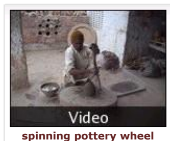
Video spinning pottery wheel

Our first stop was a Muslim potter's house. Our guide told us that one can identify caste and religion by the color of the clothes and the turbans (and the persons'