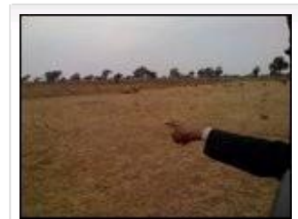
guide pointing out antelope (or blue cow)

Most of what they made was a result of recycling bits of fabric from saris, wedding dresses, and any other "costumes" and combining them into