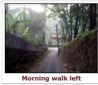
Morning walk left

everyone by pretending to read the Malayalam headlines—but Gramps had the last laugh because he'd