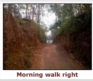
Morning walk right