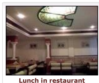
Lunch in restaurant

A short taxi ride took us to the airport, where we got to wait longer. Our new